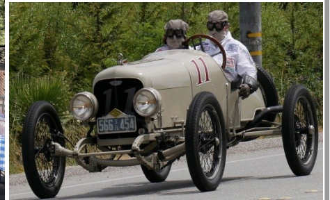
On the Run!