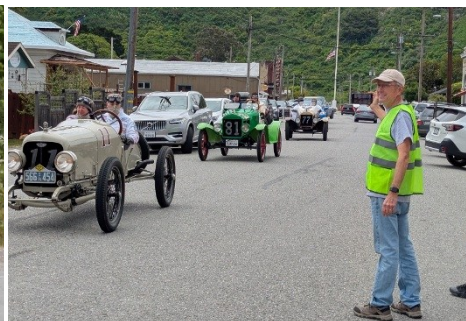
Waving in the Speedsters at the Pescadero Lunch Stop