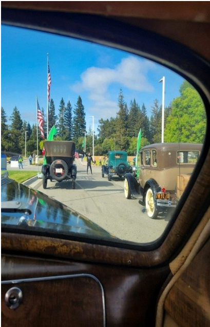
The Starting Line: Model T's, Model A's, A Pierce Arrow and other classic cars joined the Lowland Tour