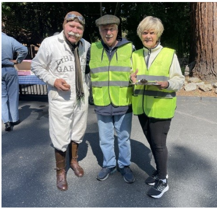
The Donut Stop