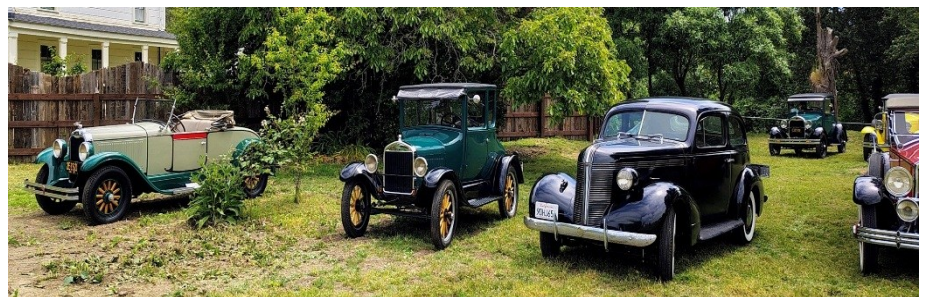
Lunch Stop in Pescadero